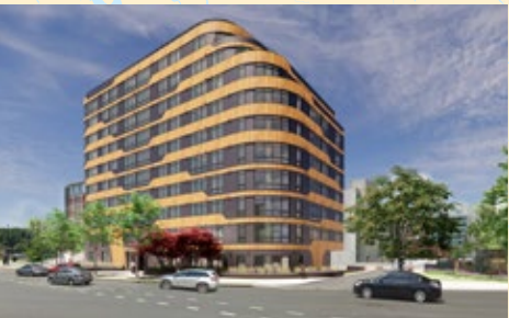
Parcel 42/Station U & O, Washington, D.C.

We fund affordable housing within a half mile from public transit, making it easier for residents to access critical resources like jobs, schools, and retail. Residents living in Amazon-funded affordable housing units can save up to $7,000 per year on transportation costs.