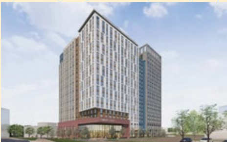
Dominion Square, Tysons, VA

122 affordable apartment homes in an apartment community that will include 574 residential units total, near the Grosvenor-Strathmore Metro Station in Bethesda, to be developed on land owned by (and in partnership with) the Washington Metropolitan Area Transit Authority.