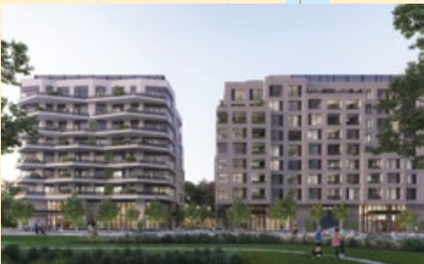
Strathmore Square, Bethesda, MD

Parcel 42/Station U & O, a mixed-use residential and retail development in D.C.’s Ward 2, will provide 108 affordable apartment homes. These units will serve residents earning between 30% to 80% of the area median income. In addition to retail, the development is conveniently located near area shopping, schools, and transit.